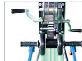
CS - series Manual Operation