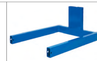
Standard Fork(Part#3017008) ◆ Come standard with each ES/CS lifter. ◆ Load capacity - 300 kg ◆ Weight - 14 kg ◆ Dimensions - 600x700x355 mm