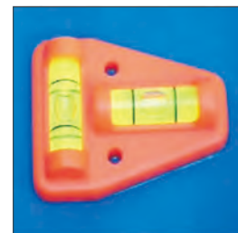
Equipped with level to help operator ensure safe setup.

(Specifications subject to change without notice)